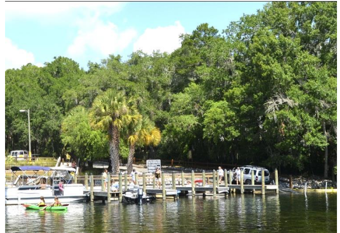
K P Hole Boat Ramp