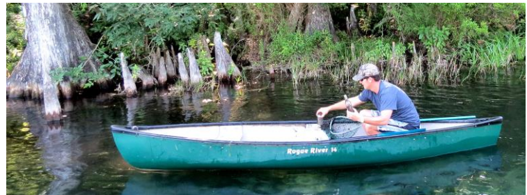
Collecting trash during 2015 Rainbow River cleanup

RRC again set up its education booth April 18 th at Boomtown Days. Lots of interaction with the public occurred and a number of RRC T-shirts were sold. May 16 th RRC held its Annual River Cleanup. About 175 individuals participated in collecting trash and about 125 of them stayed at Rio Vista Park for the RRC sponsored lunch. Food and door prizes were provided by several of the Dunnellon merchants. The RRC members annual meeting is scheduled for December 5 th .