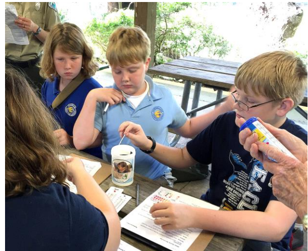
Students use test strips to evaluate nitrogen in spring water

The RRC elementary school education program has been a great success. A class of fourth graders from Dunnellon Christian Academy converged on Rainbow Springs State Park April 29 th to take part in field studies geared to their young inquiring minds. May 26 th through May 28 th six classes of fourth graders from Dunnellon Elementary School also came to the park to engage in these studies. One education module utilized a chemical test kit to measure the level of nitrates in a sample of water from the river. Another module consisted of having the students construct their own aquifer models to see how excessive fertilizer use could pollute our aquifer. Seven such modules have been developed to be consistent with school science standards but are designed to emphasize the importance of protecting our aquifer and springs. The students are given pre-tests and post-tests by their teachers concerning their knowledge of factors influencing the quality of these natural resources. The children and the teachers accompanying them were excited and enthusiastic. The RRC and Park lay instructors and assistants were given high marks by both the students and their teachers and the students themselves showed substantial strides in knowledge as a result of this program. Three schools have already signed up for the program to be offered next November. If you would like to assist in this learning experience for young inquiring minds please contact jonbrainard@gmail.com .