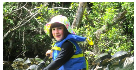
Discovering turtles while paddling the Rainbow River

As you know 75% of the voters approved Constitutional Amendment 1 last November to dedicate 33% of document stamp tax to the purchase of conservation lands to protect water resources. However, during the recently completed legislative session our politicians chose to divert most of this money to numerous other state programs having nothing to do with conservation and the environment. As a consequence Earth Justice has filed a lawsuit against the legislature on behalf of conservation and environmental organizations. You might look up Earth Justice and make a tax deductible donation to help fight this legislative travesty.