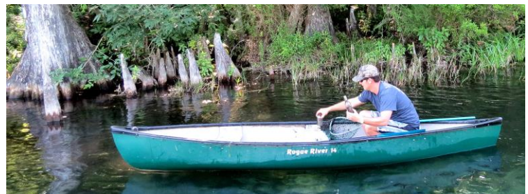
Collecting trash during 2015 Rainbow River cleanup

RRC again set up its education booth April 18 th at Boomtown Days. Lots of interaction with the public occurred and a number of RRC T-shirts were sold. May 16 th RRC held its Annual River Cleanup. About 175 individuals participated in collecting trash and about 125 of them stayed at Rio Vista Park for the RRC sponsored lunch. Food and door prizes were provided by several of the Dunnellon merchants. The RRC members annual meeting is scheduled for December 5 th .