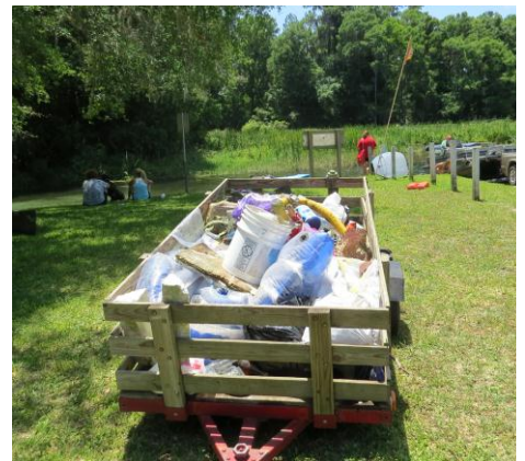
River Cleanup 2015