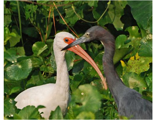
White Ibis and Little Blue Heron next to river.

One of the great reasons RRC wants to protect the Rainbow River is its abundant and unique population of wildlife. For instance, RRC member Sandra Marraffino recently completed a one-day survey of birds along the river and found 41 different species including three of the eight listed species she has seen in the past. Florida Sandhill Crane, Limpkin, Little Blue Heron, Osprey, Snowy Egret, Tricolored Heron, White Ibis and Wood Stork are listed species often seen foraging on the Rainbow River.