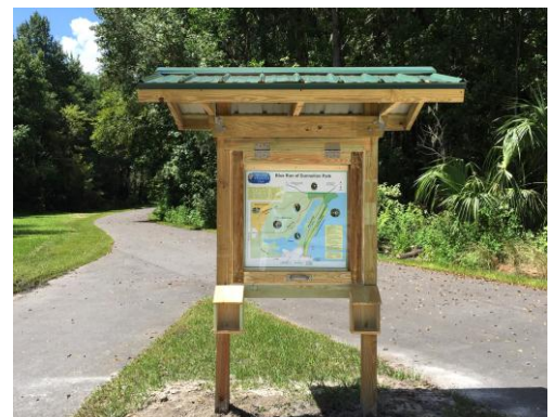
New kiosk at Blue Run of Dunnellon Park

Great strides continue to be made in fulfilling the Blue Run Park management plan. In recent months new kiosks, interpretive signs, benches, and bike racks have been installed. The greatest needs that remain are a bathroom facility, picnic pavilions, and a pedestrian bridge over the Rainbow River. Just last week the City of Dunnellon's Community Redevelopment Area Advisory Board voted to set aside $30,000 to fund engineering and architectural planning for the bathroom facility. Marion County Parks and Recreation personnel are spearheading this development effort and hope to help fund the construction.